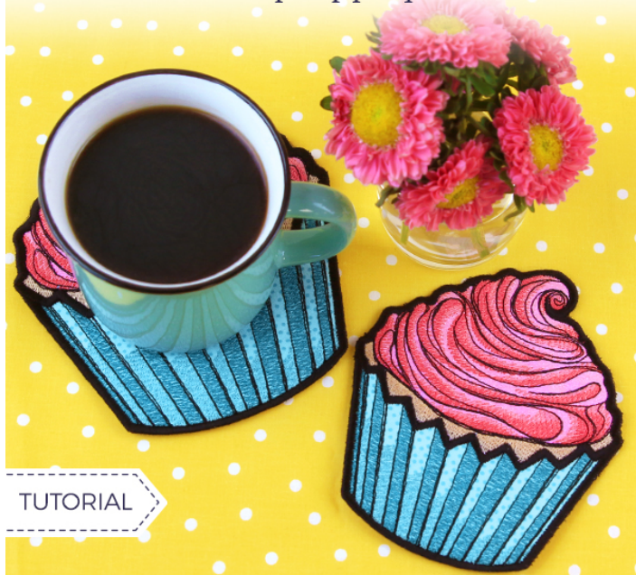
In-the-Hoop Applique Trivet