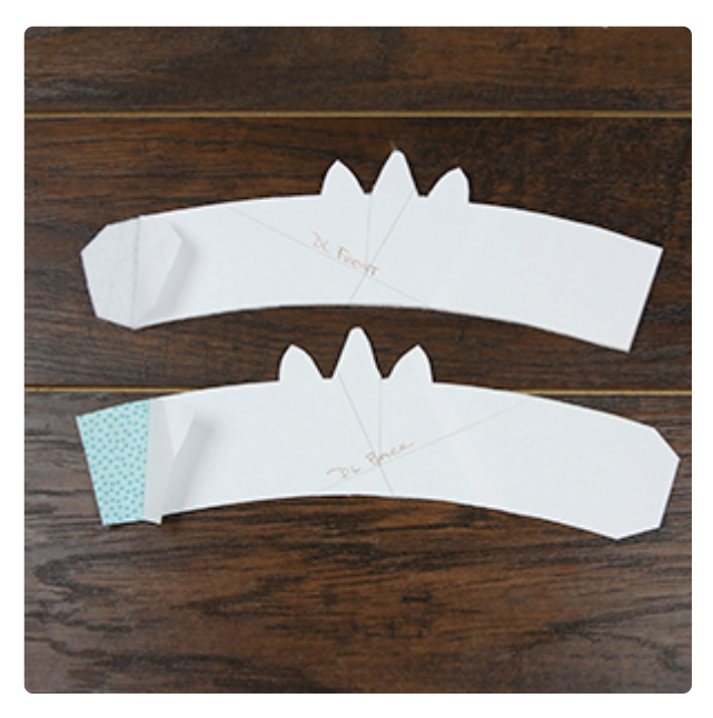
Cut out the shapes.