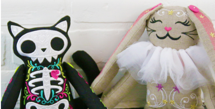
In-the-Hoop Jointed Doll

Four buttons for the bunny, or three buttons for the kitty (1/2" - 3/4")