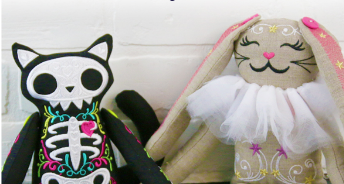
In-the-Hoop Jointed Doll

Four buttons for the bunny, or three buttons for the kitty (1/2" - 3/4")