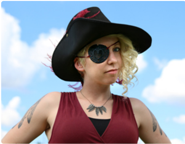
This eye patch is worthy of a mighty pirate!