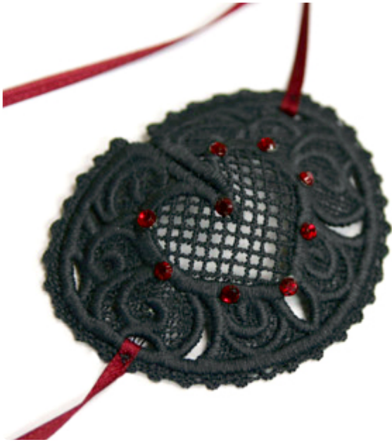
A little embellishment goes a long way!