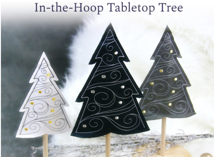
In-the-Hoop Tabletop Tree